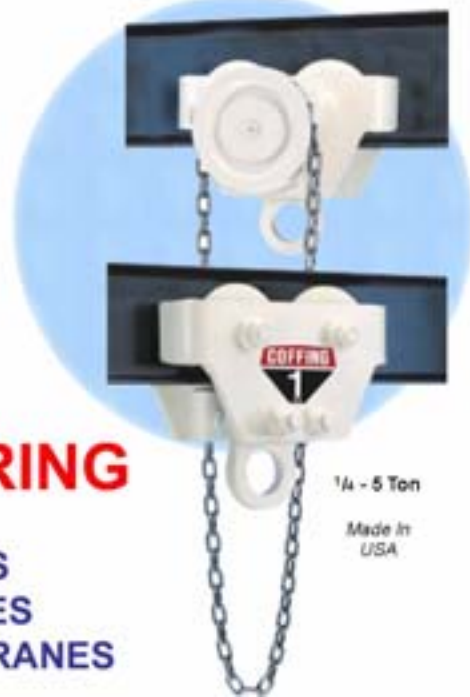
1/4 - 5 Ton Made in USA

MANUFACTURING JIB CRANES GANTRY CRANES MONORAIL CRANES OVERHEAD BRIDGE CRANES