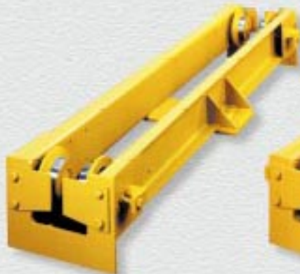
Underhung Push-Type End Truck Capacities to 5 Tons Spans to 36 Feet