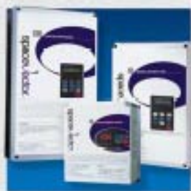
Space Vector™ Variable Frequency Drives