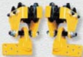
Underhung Clevis-Type Capacities to 1 Ton Spans to 25 Feet