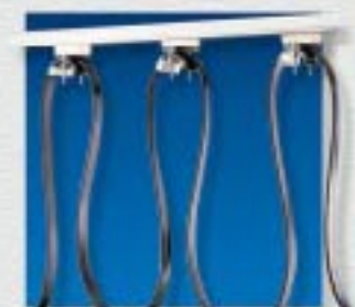
Track Suspended Festooning