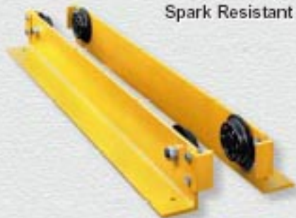
Underhung Angle-Type End Truck Capacities to 2 Tons Spans to 30 Feet

Spark Resistant Components Available For All Models