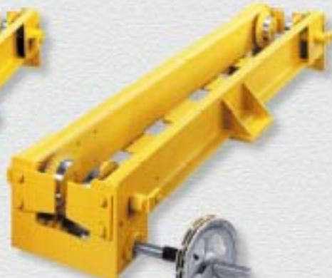
Underhung Hand Geared End Truck Capacities to 5 Tons Spans to 36 Feet