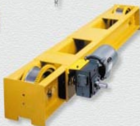
Top-Running Motorized End Truck Capacities to 5 Tons Spans to 36 Feet

* Top-Running Trucks Have Cast Iron Wheels