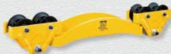
Underhung Carriage-Type End Truck Capacities to 3 Tons Spans to 30 Feet