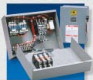
NEMA Control Panels