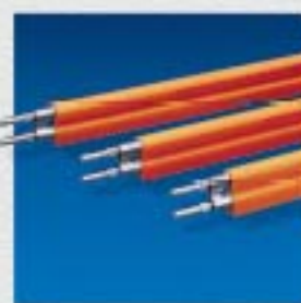
Shielded Bar Conductors