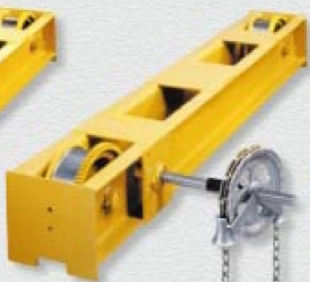
Top-Running Hand Geared End Truck Capacities to 5 Tons Spans to 36 Feet