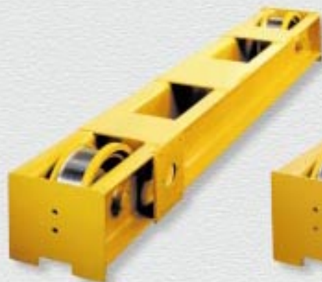
Top-Running Push-Type End Truck Capacities to 5 Tons Spans to 36 Feet