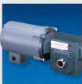
Special Drive Motors and Reducers