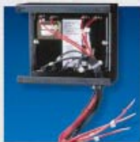
Electronic Acceleration Control